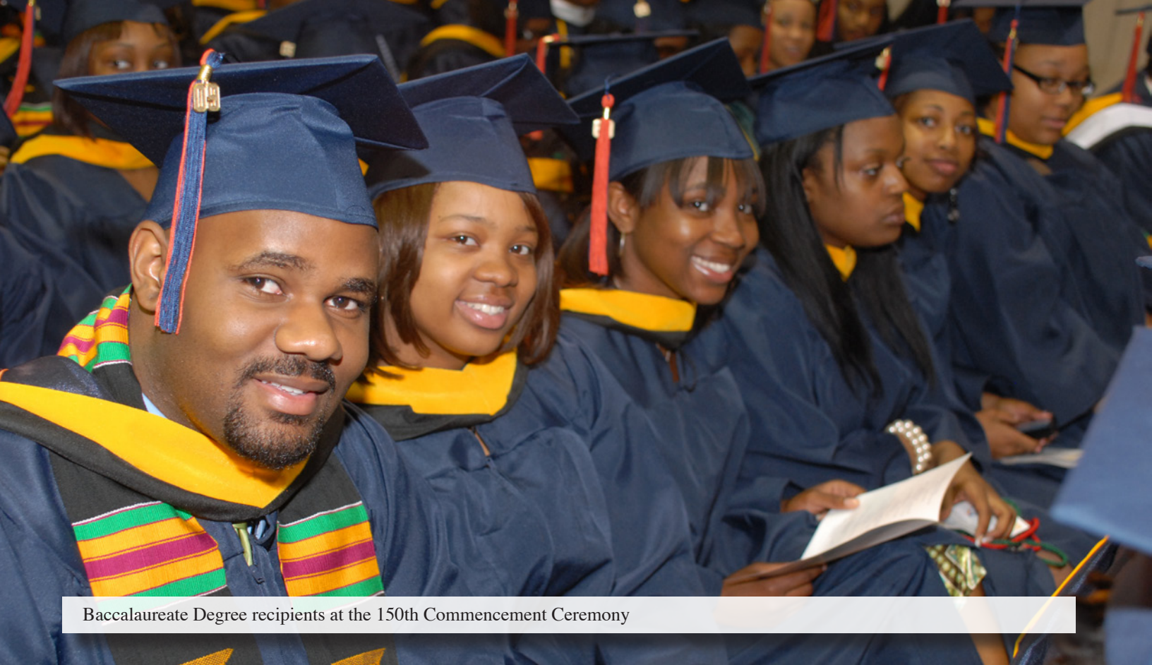
Baccalaureate Degree recipients at the 150th Commencement Ceremony