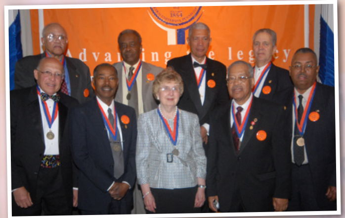
1959 (Emeritus Class)